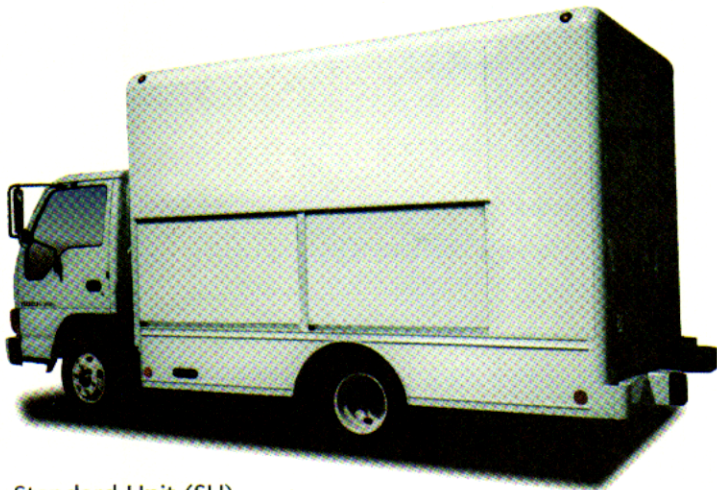
Standard Unit (SU)

With The Contractor Service Vehicle From Hackney.